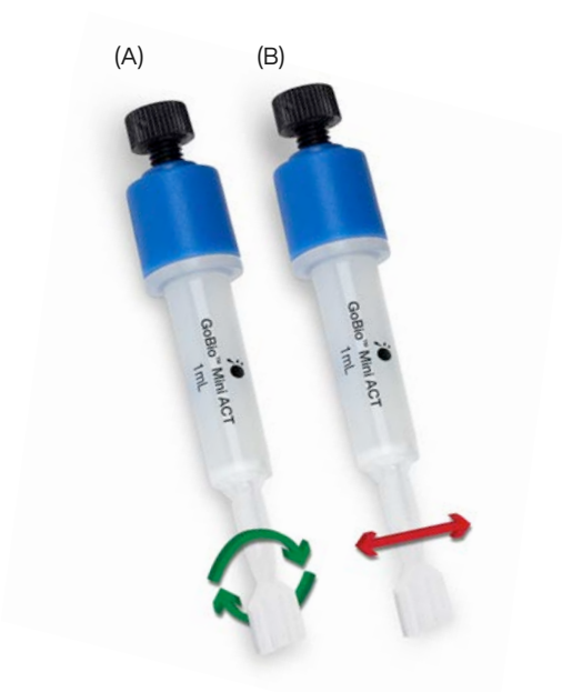
Figure 2. Removal of the cut-off end at the column outlet should be done by cutting or by twisting (A) not bending (B).