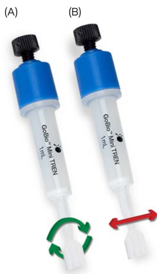
Figure 2. Removal of the cut-off end at the column outlet should be done by cutting or by twisting (A) not bending (B).