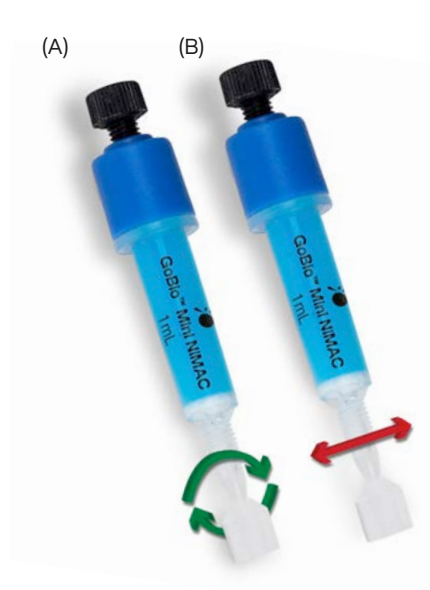
Figure 1. Removal of the cut-off end at the column outlet should be done by cutting or by twisting (A), not bending (B).

Connect the column to your equipment using the recommended connectors shown in Table 1. Fill the equipment with deionized water and make drop-to-drop connection with the column to avoid introducing air into the column. Carry out all steps, except for sample application, at 1 mL/min (GoBio Mini 1 mL column) or 5 mL/min (GoBio Mini 5 mL column).