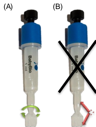
Figure 2. Removal of the cut-off end at the column outlet should be done by cutting or by twisting (A) not bending (B).

Connect the column to your equipment using the recommended connectors shown in Table 1. Fill the equipment with deionized water or buffer and make drop-to-drop connection with the column to avoid getting air into the column. Carry out all steps, except for sample application, at 1 ml/min (BabyBio 1 ml column) or 5 ml/min (BabyBio 5 ml column).