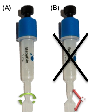
Figure 2. Removal of the cut-off end at the column outlet should be done by cutting or by twisting (A) not bending (B).

Connect the column to your equipment using the recommended connectors shown in Table 1. Fill the equipment with deionized water or buffer and make drop-to-drop connection with the column to avoid getting air into the column. Carry out all steps, except for sample application, at 1 ml/min (BabyBio 1 ml column) or 5 ml/min (BabyBio 5 ml column).