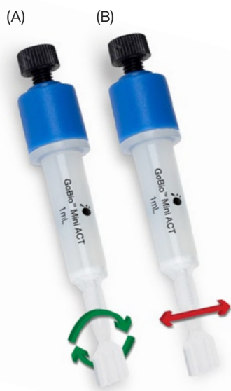
Figure 2. Removal of the cut-off end at the column outlet should be done by cutting or by twisting (A) not bending (B).

Connect the column to your equipment using the recommended connectors shown in Table 1. Fill the equipment with deionized water or buffer and make drop-to-drop connection with the column to avoid getting air into the column. Carry out all steps, except for sample application, at 1 mL/min (GoBio Mini 1 mL column) or 5 mL/min (GoBio Mini 5 mL column).