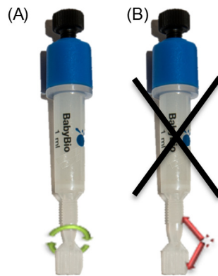
Figure 2. Removal of the cut-off end at the column outlet should be done by cutting or by twisting (A) not bending (B).

Connect the column to your equipment using the recommended connectors shown in Table 1. Fill the equipment with deionized water or buffer and make drop-to-drop connection with the column to avoid getting air into the column. Carry out all steps, except for sample application, at 1 ml/min (BabyBio 1 ml column) or 5 ml/min (BabyBio 5 ml column).